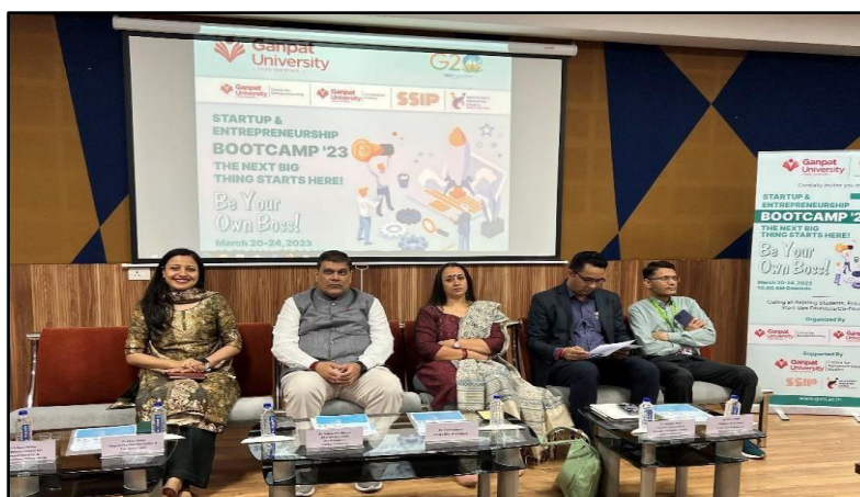
Inauguration of Bootcamp with Esteemed Dignitaries