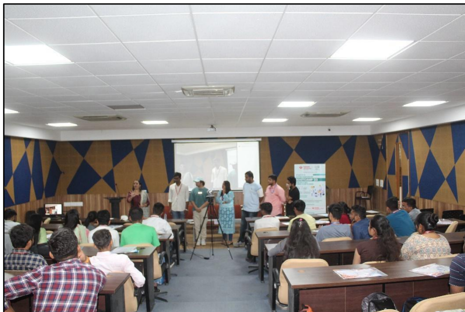
Student Activity on Creativity for Business Opportunities