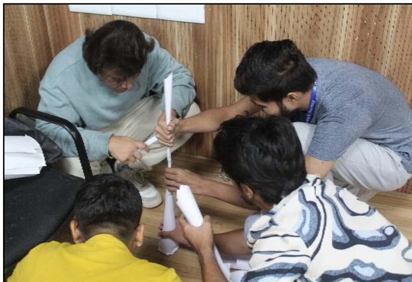
Activities on Team Consulting Session