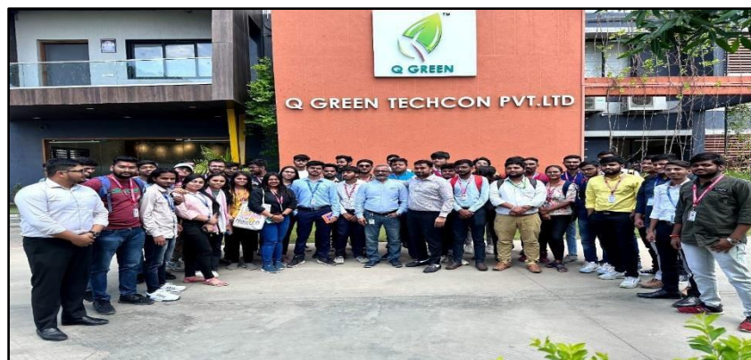
Industrial Visit at Q Green Techcon Pvt. Ltd.

Industrial visits are very important for every Engineering or Management student as it provides a clear picture to the upcoming management in the making who have the zeal for a bright future. The rationale of the professional program at Ganpat University Centre for Entrepreneurship is not only the theoretical learning inside the classrooms or just completion of syllabus but its sole objective is to have practical edge with all basic's aspects of entrepreneur's life.